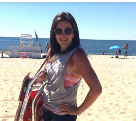
A summer trip to Nantucket