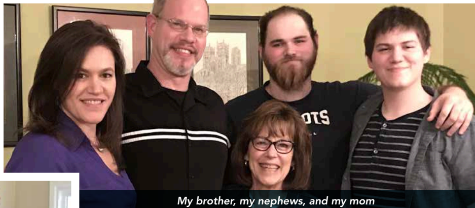
My brother, my nephews, and my mom