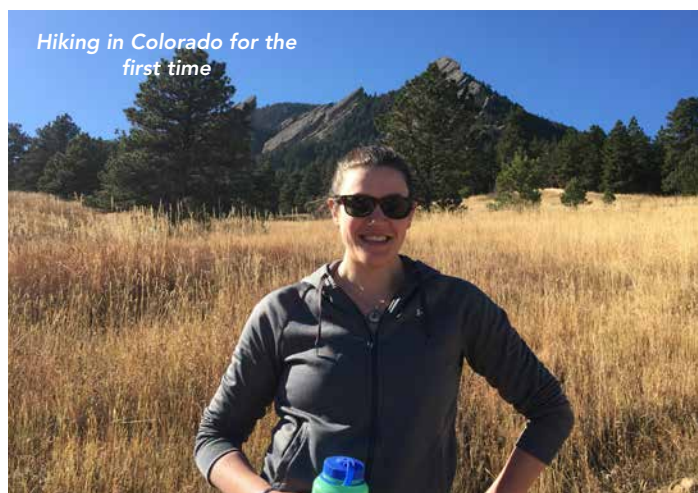
Hiking in Colorado for the first time