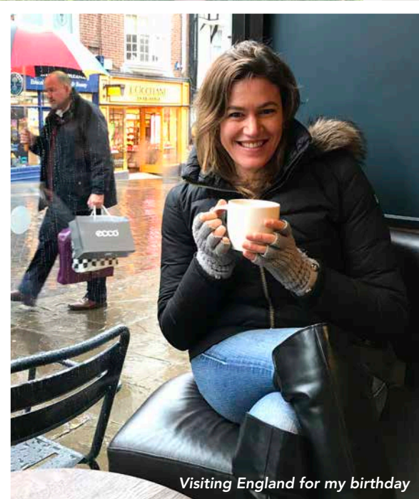
Visiting England for my birthday

My mom and dad taught me to live fully, love deeply, and dedicate myself to making this world a better place. I think it's important to work hard, and equally important to have fun and live each day to the fullest. For me, no day is complete without friends and family in it, whether that means a phone call just to say hi, a funny "this made me think of you" text, a quick bite to eat out, or a casual get-together at a friend's house.