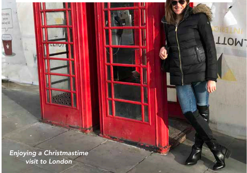
Enjoying a Christmastime visit to London