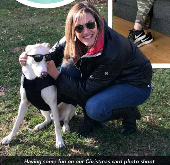
Having some fun on our Christmas card photo shoot