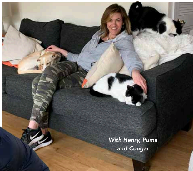
With Henry, Puma and Cougar

HENRY IS MY 1.5-YEAR-OLD RESCUE DOG – he's an energetic, loyal, and loving Lab mix. He loves attention and my friends and coworkers adore him. COUGAR AND PUMA ARE BROTHER AND SISTER CATS – I rescued them from a local shelter about 7 years ago.