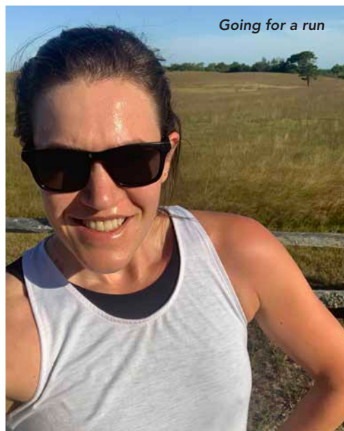
Going for a run