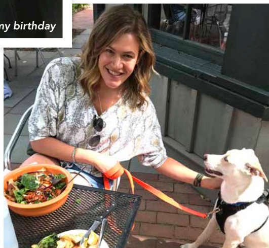
We found a dog-friendly restaurant