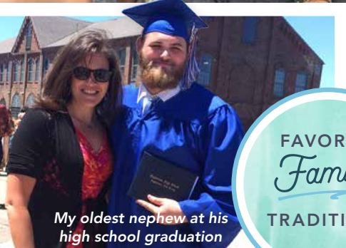
My oldest nephew at his high school graduation

I am grateful to my brother and his wife for giving me three awesome nephews and an amazing niece. I'm so proud of the unique and amazing people they have become, and happy to have lived near them as they've grown up.